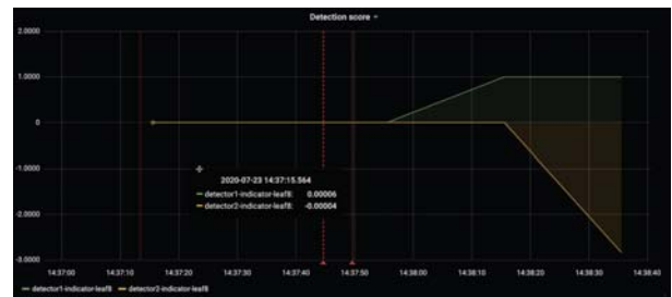
Fig. 3. The DESTIN values annotated as detector2 in this figure decrease when a routing loop is inserted. The vertical red dotted line marks the insertion of the event

destination. For instance, on leaf8, this traffic loop is about 5 Gbps which is almost 3% of the traffic destined towards specific prefix behind dr03. Since the control plane (the number of bgp sessions, session states, bgp routes from each neighbor etc.) is intact, the change cannot be simply detected by monitoring the control plane alone. The detector (DESTIN) consumes the counters and translates their dependencies into one single indicator updated per each data-point as described in detail in section IV of [1]. It then compares the values of the generated indicator using a simple sigma detector which fires an alarm if the delta between the past and the previous values cross a certain threshold. Fig. 3 depicts the divergence of values when the routing loop occurred. DESTIN’s alarm is the trigger to activate the explainer to extract the important counters that best describe what happened. The information is made available by the YANG model output which were subscribed to when the service was enabled.