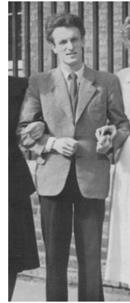
Fig. 1: Left: Pinsker before Pinsker: In Schützenberger’s notation, W is for Wald’s information, which is Kullback-Leibler divergence, and D = p - q . There is a typo at the end: minimizing x^2 + 2xy + 3y^2 for fixed 2D = y - x is said to give \frac{D^2}{3} instead of the correct \frac{4D^2}{9} . Right: Marcel-Paul (Marco) Schützenberger at his first marriage, in London, Aug. 30th, 1948.

Dans le cas dichotomique, on a l'inégalité suivante qui semble nouvelle. Ecrivons : D = p(\theta_0) - p(\theta_1) = q(\theta_1) - q(\theta_0) W \geq \frac{2D^2}{9} Posons en effet 2 p(\theta_0) = 1-x et 2 p(\theta_1) = 1-y après avoir choisi p de telle sorte que x soit positif. On peut développer W en série de puissance de x et de y : 2 W = (1-x) \text{Log}(1+x)/(1-y) + (1+x) \text{Log}(1+x)(1+y). On trouve : W = \sum_{i=1}^{\infty} (4 i^2 - 2i) - 1 (x^{2i} - 2ixy^{2i-1} + (2 i-1)y^{2i}) Tous les termes sont positifs car le polynome t^{2i} - 2it + 2i - 1 a un unique extremum pour t = 1 et prend en ce point la valeur 0 . Bien plus : x^{2i} - 2ixy^{2i-1} + (2i-1)y^{2i} = 4 D^2 (x^{2i-2} + 2x^{2i-3}y + 3x^{2i-4}y^2 + \dots + (2 i-1)y^{2i-2} ) Par conséquent W est plus grand que la somme des deux premiers termes de son développement qui sont : 4 D^2 / 2 \text{ et } 4 D^2 / 12 (x^2 + 2xy + 3 y^2) et la valeur de ce dernier polynome étant supérieure pour D fixe à D^2/3 on trouve bien le résultat.