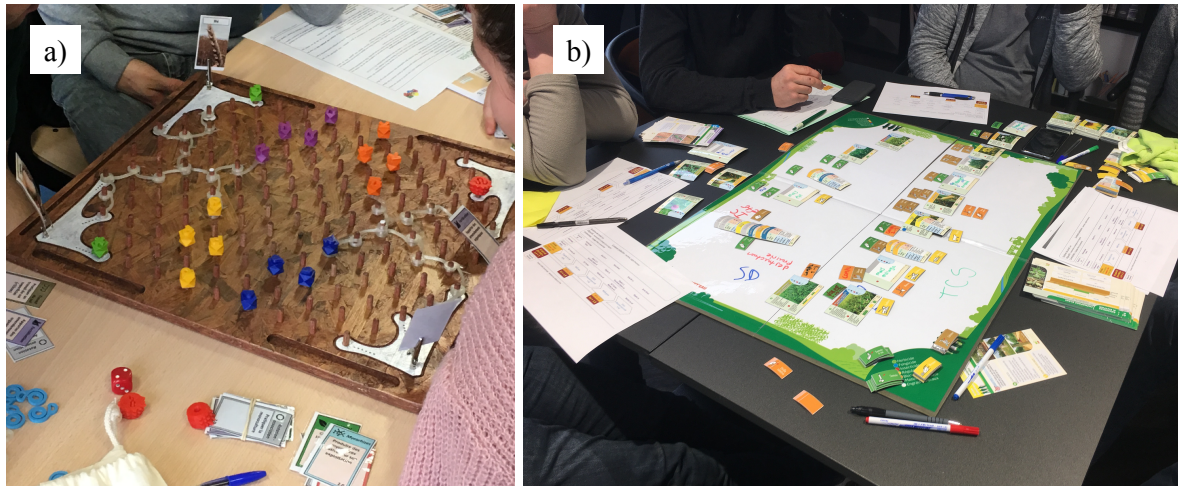
Fig. 3: Use of design-support tools to visualize the object under design. Establishment of mycorrhizal network between the plant roots (at the four corners) on a board game, in order to reach the nutritive resources (colored pieces), using sticks representing mycorrhizal filaments (in white) and cards describing practices influencing the mycorrhizal network (case D6, Fig. 3a). Design of a conventional CS without glyphosate using the board game Mission Ecophyt'Eau, crop cards and practice cards (case D4, Fig. 3b).