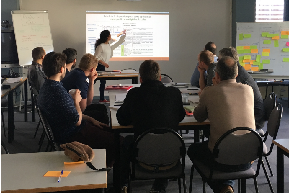
Fig. 1: Design workshop that brought together farmers, advisers and scientists to co-design organic crop management of rapeseed for two farmers of the group.