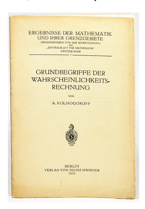
Figure 1: The original cover of the Grundbegriffe der Wahrscheinlichkeitsrechnung , published in German by Springer in 1933.

He is (probably) best known for his work on probability theory and particularly for his Grundbegriffe der Wahrscheinlichkeitsrechnung ("Foundations of the theory of probability"), a modest 60-page monograph published in 1933. By reconstructing rigorously the whole theory of probability, his little book has totally revolutionized the field, both scientifically and culturally.