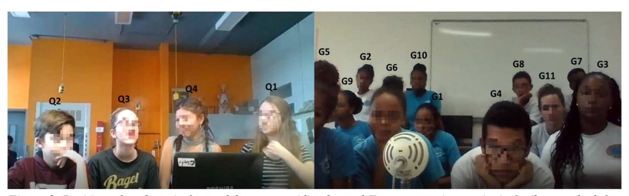
Figure 2. Position of students in front of the camera (Geothermal Energy experimentation), Québec on the left, Guadeloupe on the right.

The sequence that we present took place during the third session of the experimentation and its duration is approximately 4 minutes. There are four students in Québec (Q1 to Q4) and 11 in Guadeloupe (G1 to G11). Figure 2 shows the position of students in front of the camera.