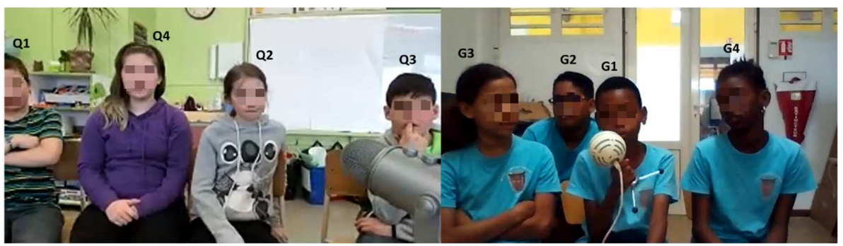
Figure 4. Position of students in front of the camera (Traditional Folktales experimentation): Québec on the left, Guadeloupe on the right.

The sequence that we present concerns mirroring teams number 2 and takes place during the third session of the experimentation. Its duration is about 13 minutes. There are four students in each mirroring team (Q1 to Q4 and G1 to G4). Together, they must create the characters of the common tale from the characters of the two regional folktales. The instruction for the session is to discuss ways of collecting data on characters in the tales. Each team has prepared solutions and students are asked to discuss their solutions. Figure 4 shows the position of students in front of the camera.