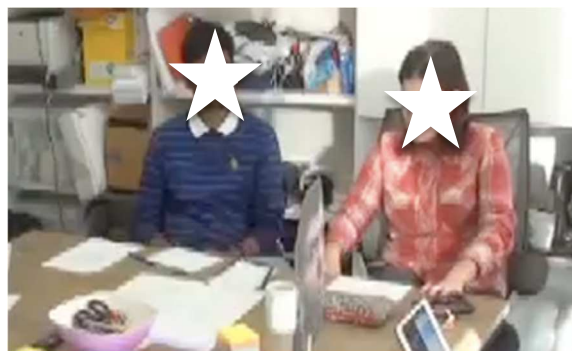
Figure 4. S2 (on the right), Group 1, shaking the table to illustrate feeling of co-presence in space