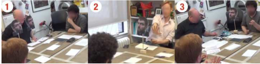
Figure 1. Argument Clinic activities (Group 2): 1) Role attribution, 2) First debate, 3) Second debate (after roles are switched)