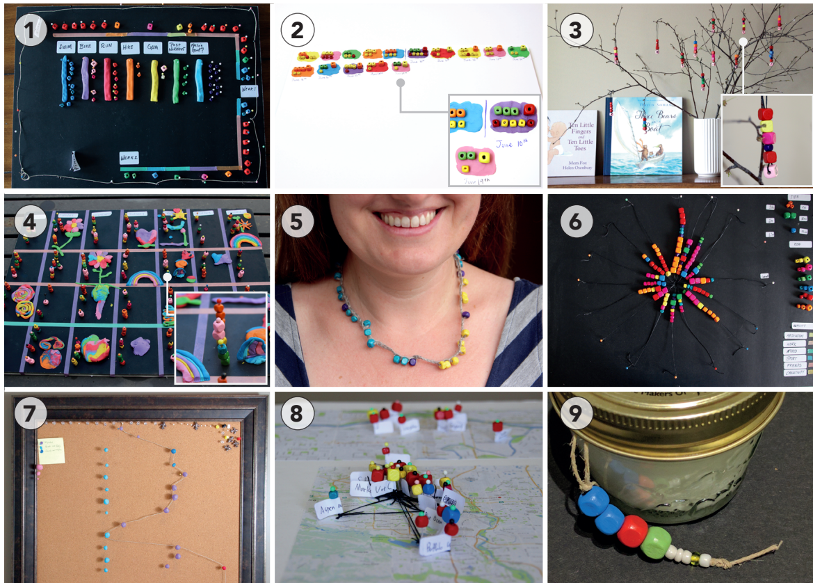
Figure 1. Overview of all 9 participants' projects. The topics are: (1) workouts, (2) hip pain, (3) mood, (4) nutrition and bowel movements, (5) distractions during writing, (6) enjoyment of activities, (7) meditation, (8) places visited in a new city, (9) recipes for homemade care products.

[P5] Distractions during Writing: P5 created wearable physicalizations of distractions during her thesis writing. She anticipated that wearing them would motivate her to be focussed. She made one bracelet/necklace for each work day with one stitch representing 3 minutes of work and beads showing times of distraction (see Fig. 1.5). Work sessions are separated with purple beads. The colour of other beads shows whether tasks for each session were accomplished. Because “ the process has not been as motivational as expected ”, P5 started using the physicalization “ in an explorative way ”. This approach helped her develop more productive work strategies. The process further encouraged her to become “ more compassionate ” with her own ways of working.