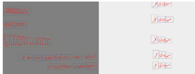
Figure 1. Handwriting samples (in red). Extracted segments are enclosed in blue boxes.

For tasks 4 to 7, features are extracted for each word segment separately and the mean of all the segments’ features is calculated per task.