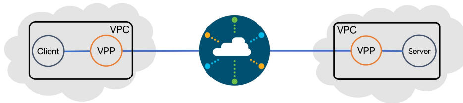
Figure 1: Simplified view of our initial topology. The AWS Regions explored are Paris, London, Ireland, Oregon, Sao Paolo, Tokyo, Sidney .