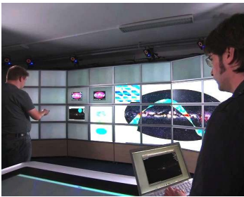
Figure 1: Substance Canvas [5] running on a 16-computer wall-sized display and a tabletop surface. An application running on the laptop (bottom, right) is synchronized to the wall. A user (left) scales up a vector-based view of the application using a motion-tracked pointer.

Not only is it challenging to design appropriate interactions and mental models for these kinds of environments, but also it raises additional challenges for their implementation. Multi-surface environments are frequently dynamic: new devices may enter and leave the environment. They are also inherently distributed: interaction may span multiple devices. For example, interaction may use a smartphone and input controlled through a tracking system, computation may take place on a computing cluster in the room, and output may be split across the smartphone and wall. A specific