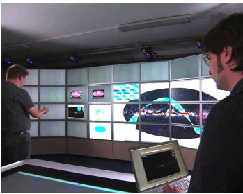
Figure 1: Substance Canvas [5] running on a 16-computer wall-sized display and a tabletop surface. An application running on the laptop (bottom, right) is synchronized to the wall. A user (left) scales up a vector-based view of the application using a motion-tracked pointer.

Not only is it challenging to design appropriate interactions and mental models for these kinds of environments, but also it raises additional challenges for their implementation. Multi-surface environments are frequently dynamic: new devices may enter and leave the environment. They are also inherently distributed: interaction may span multiple devices. For example, interaction may use a smartphone and input controlled through a tracking system, computation may take place on a computing cluster in the room, and output may be split across the smartphone and wall. A specific