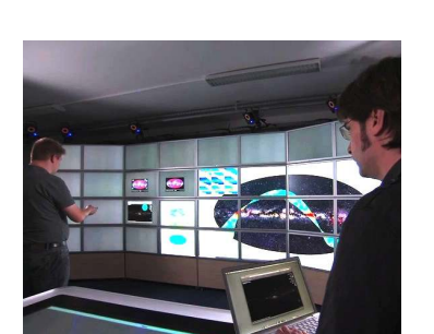
Figure 1: Substance Canvas [5] running on a 16-computer wall-sized display and a tabletop surface. An application running on the laptop (bottom, right) is synchronized to the wall. A user (left) scales up a vector-based view of the application using a motion-tracked pointer.

Regardless of which devices are available in a particular interactive environment, our goal is to enable all of these devices to work seamlessly together, as if they were all designed for such an environment. We call these rooms multi-surface environments . One potential scenario for such a room, for example, involves a scientist who should be able to enter with the latest set of telescope imagery on her smartphone, slide it onto an interactive table using a pick-n-drop-like technique [6], and collaboratively triage those images around the table with her colleagues. When identifying an image for further analysis, she should be able to easily slide it onto the wall, showing a