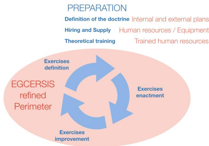
Figure 2: The refined location of the EGCERSIS research program in the Preparation phase for critical sites

The reason why the EGCERSIS research program focuses on those steps (definition, enactment, and improvement of exercises) of the Preparation phase is mainly due to the fact that these steps are the less efficient ones. This part of the preparation truly requires a concrete breakthrough to overcome the current limitation training exercises.