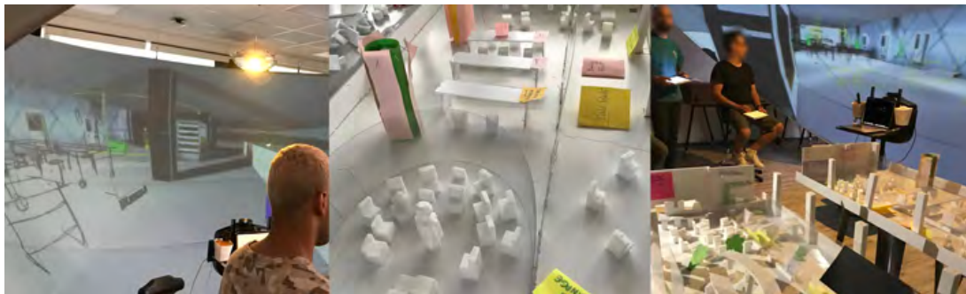
Figure 4. Hyve-3D allowing collective 3D sketching; and rough scaled physical models.

This last example took place in another university (in another country) where, this time the Hyve-3D was transported and installed. The participants were again users and employees of the the library and 1 design accompanists per team (2 teams of 6). Concerning the representational ecosystem, once again scale model pieces were pre-cut and used as boundary objects to assemble the physical model while designing the ideas. The Hyve-3D, compared to HIS, allows collective 3D sketching using two handheld tablets. In that concern, we also provide a basic 3D model as a contextual background, made from SketchUp and textured in a baking process using a rendering software (Figure 4). In two periods of 30 min., four participants were trained to sketching in 3D using the two tablets of the Hyve-3D.