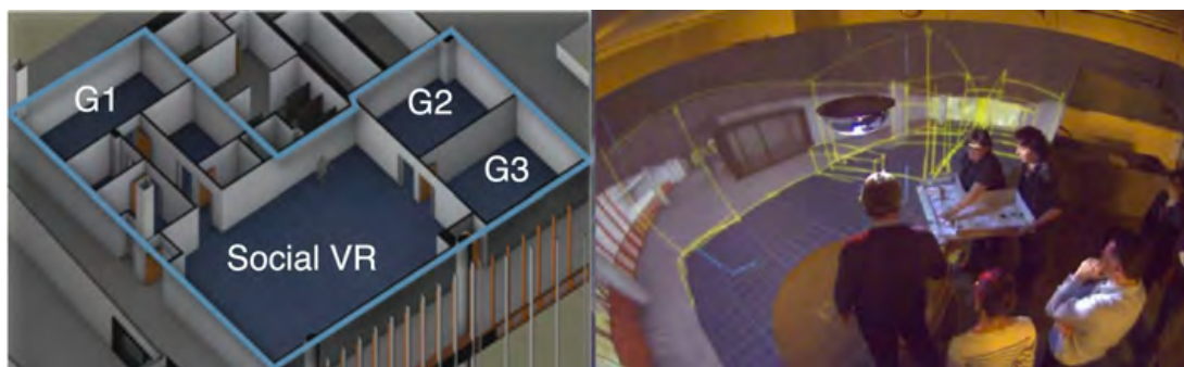
Figure 2. (Right) Space to be redesigned and the sub-spaces of the workshop for each group (Left) Social VR displaying a virtual model and digital sketches combined with a scaled model.

The workshop we conducted consists in the re-design of an existing teaching space in the building of the business school, underused and inappropriate (Figure 2). This space is composed of a large main room and six small rooms and is designed to support negotiation courses. Participants (24) were divided into three groups, and each group had the goal to achieve a design proposal for the future space. Since the Social VR systems are mobile, this workshop took place into the same space to be redesigned, allowing participants to use elements of the real space as a support and as referents for discussion in a context of mixed reality (Safin et al. 2013). Figure 2 shows the different sub-spaces (one room per group) and a central room with the Social VR system (HIS) installed in the center of the redesigned space. Digital models of this space were built and displayed in the HIS as 360° panoramas. Participants therefore had the opportunity to see an immersive projection of a digital model of the design space in the heart of this real space, with the possibility of aligning the same point of view. In the HIS, no special skills was required since the participants were sketching (life-sized) over the immersive panorama. Spontaneously, some participants were manipulating the digital pencil of the Wacom Cintiq tablet of the HIS, while others were designing and discussing alternating from the immersive representation and the real space, visually accessible from the HIS.